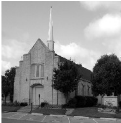
Justin United Methodist Church

Contact information: Church 940-648-2594