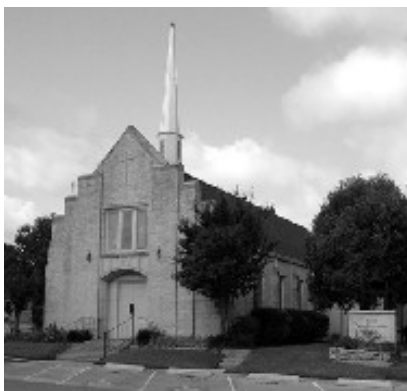
Justin United Methodist Church