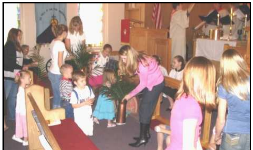
The children on Palm Sunday bringing in the Palms. They walked throughout the Sanctuary.