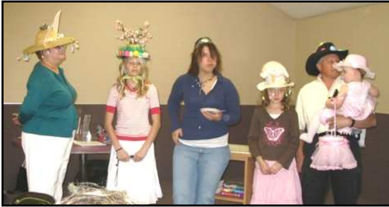
The Easter Bonnet Contest. Weren't they all winners.